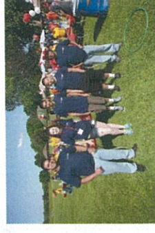
Volunteering at Heart Walk

Advisor for an application form and more information.